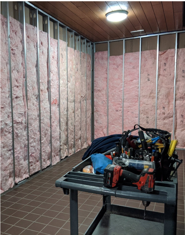
Insulation in the temporary walls helps to reduce construction noise and allow crews to work quietly throughout the day.