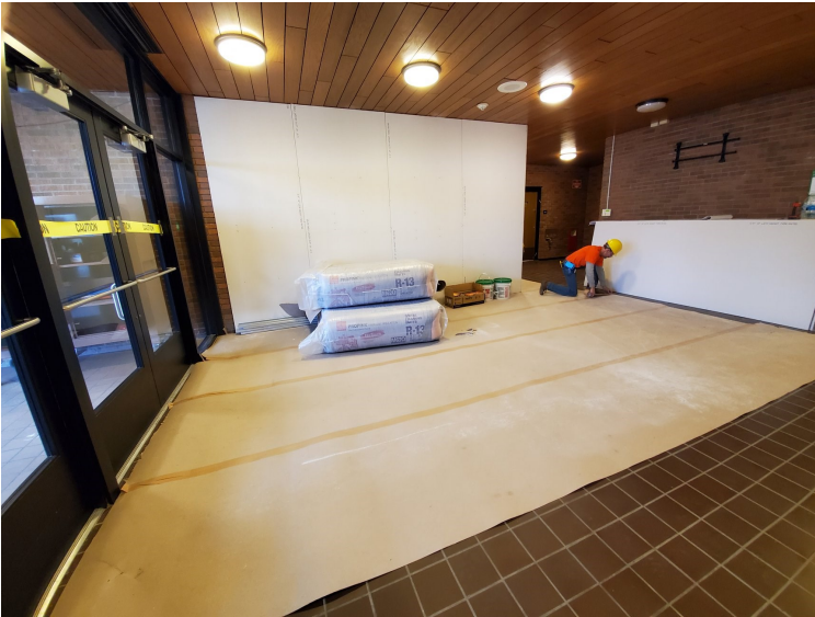
The front entrance of the Middle School is closed for construction. Crews are working on renovating the Main Entrance. When work is completed, the Middle School will have a secure entry area.